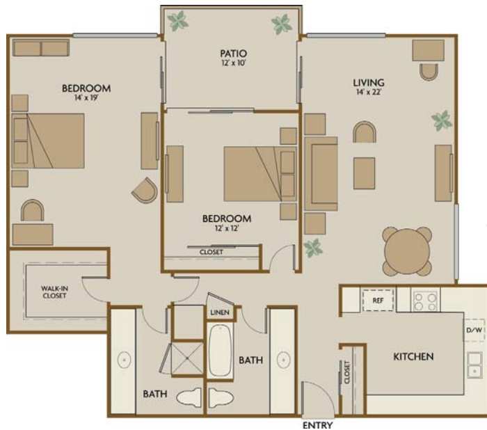
Waters Edge Two Bedroom Two Bath 1252 Square Feet Call for pricing

Rental rates and availability are subject to change. Square footage and/or room dimensions are approximate, and may vary between individual units. Please ask a leasing associate for more details