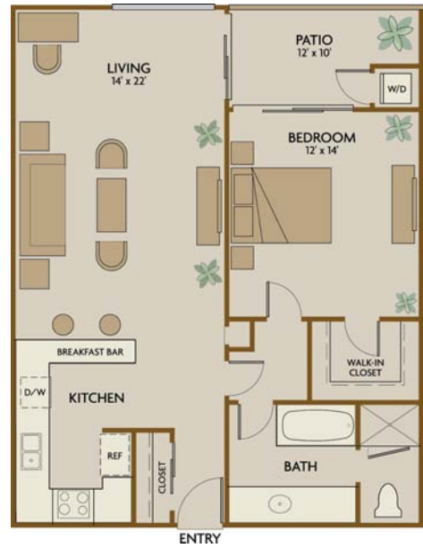
Waters Edge One Bedroom - One Bath 843 Square Feet Call for pricing