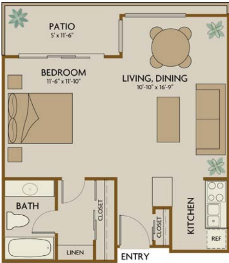
The Tides Studio One Bath 520 Square Feet Call for pricing