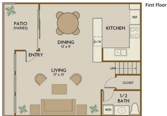
The Tides Two Bedroom Townhome - One and Half or Two and Half Bath 1285 Square Feet - Call for pricing