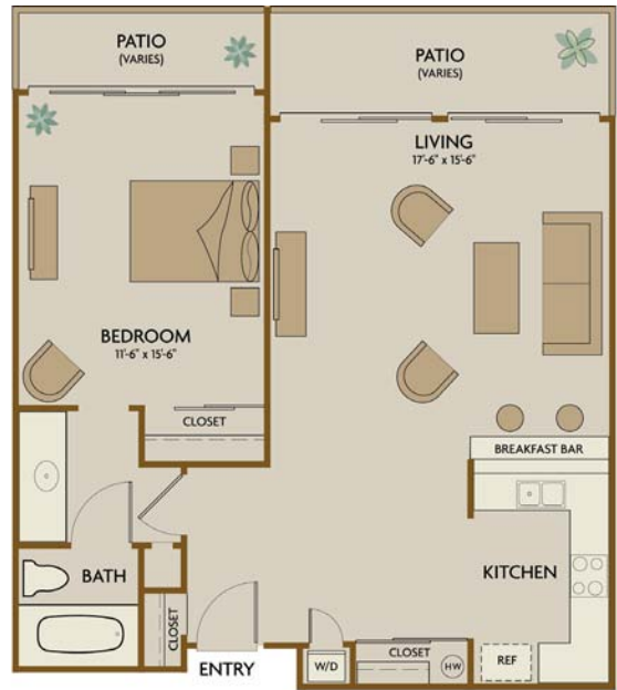
The Tides One Bedroom - One Bath 750 Square Feet Call for pricing